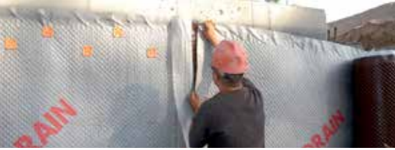
Simple overlap detail.