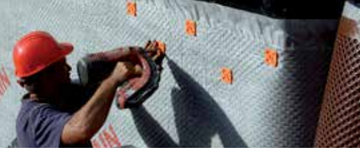
Easy installation with DELTA®-FAST'ners.