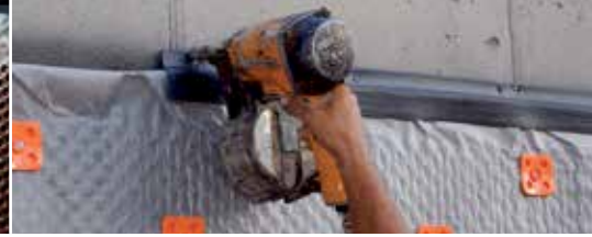
DELTA®-MOLDSTRIP for secure terminations.