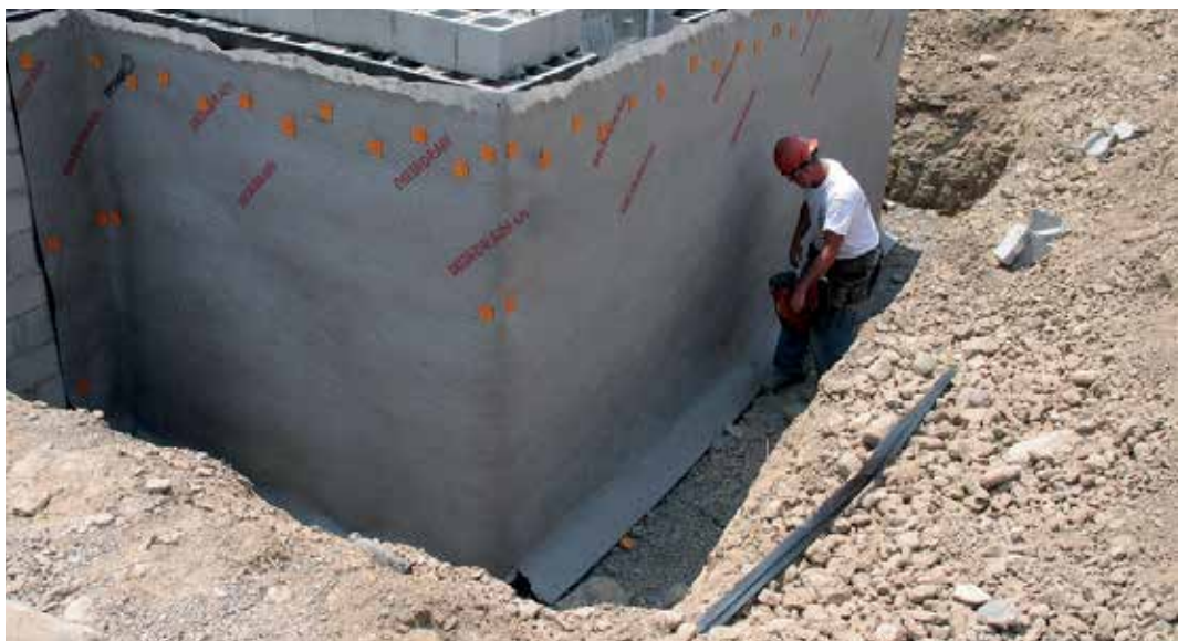
Bend DELTA®-DRAIN at footing to drain water away from cold joint.