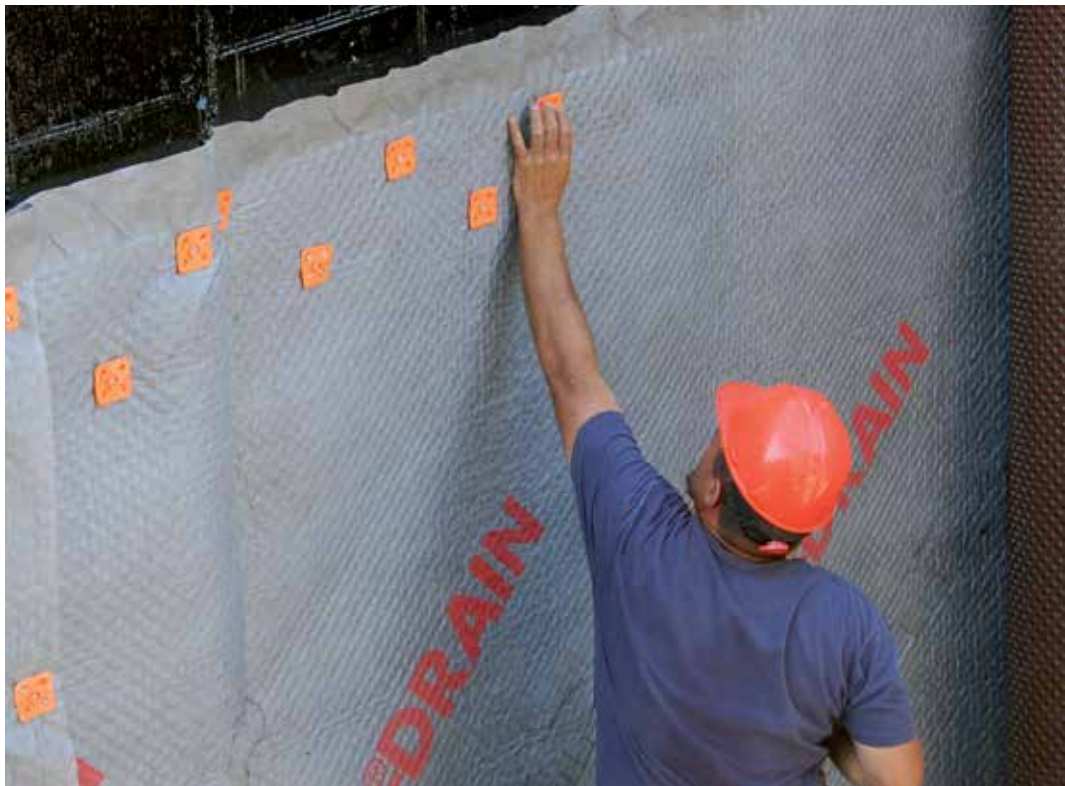
DELTA®-FAST'ners hold DELTA®-DRAIN tightly to foundation wall.